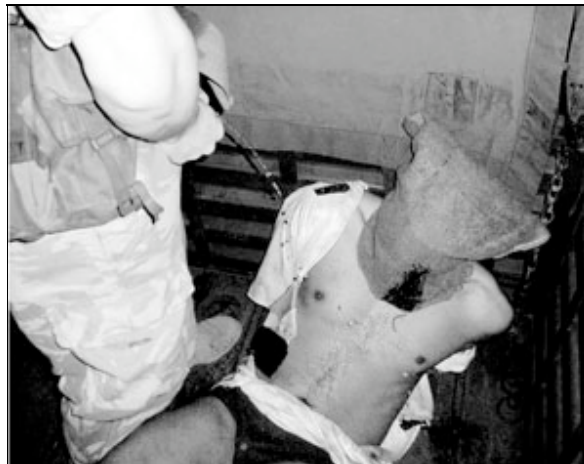
URINATED ON: A British soldier urinates on an Iraqi prisoner in a vile display of abuse. The captive was beaten and hurled from a moving truck. Army chiefs are investigating.

After an EIGHT-HOUR ordeal, he was left barely conscious and close to death. Bleeding and vomiting and with a broken jaw and missing teeth, he was driven from a Basra camp and hurled off the truck. No one knows if he lived or died.